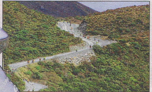
Long haul: The route is described as "the coldest, longest, most gruelling and uncomfortable test of endurance on a city scooter".