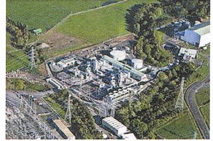
Powering up: Contact Energy's Stratford Power Stations. The new Stratford Peaker Plant is to the left of the older Taranaki Combined Cycle station, at the rear of the site.